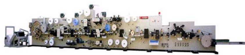
YX-YKJ-150A Baby Diaper Machine