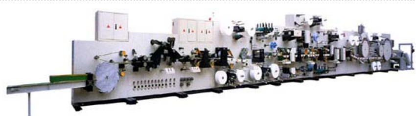
YX-YKJ-150B Full-Automatic High-speed Baby Diaper Machine