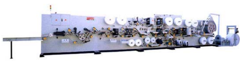
YX-NPJ-150 Baby Diaper Pad Machine