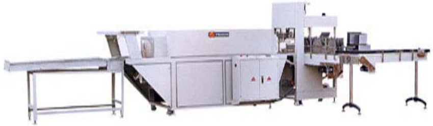
YX-ZBJ Series of P.E Film Shrinkage Packing Machine