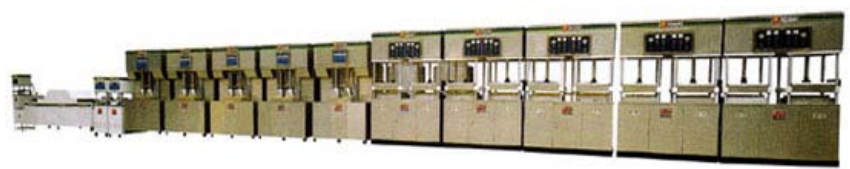
YX-ZMC1-4 Series of Paper Pulp Mold Tableware Complete Sets