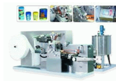
YX-30 double infolding and no core can wet tissue machine