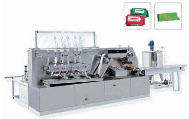
YX-5 Semi-automatic wet tissue machine