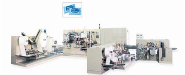
YX-80F wet tissue machine