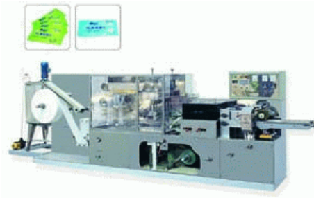
YX-200 Full automatic wet tissue making and packing machine