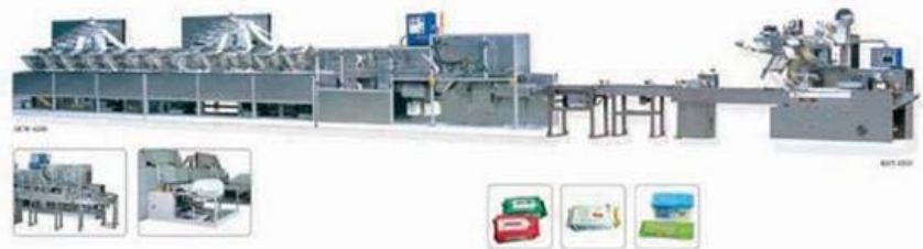
YX-4200& KGT-320II wet tissue machine