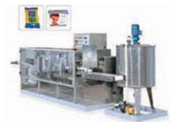
YX-2II wet tissue folding machine