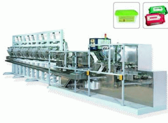
YX-2700L wet tissue machine