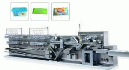
YX-2500Z full automatic high-speed wet tissue machine